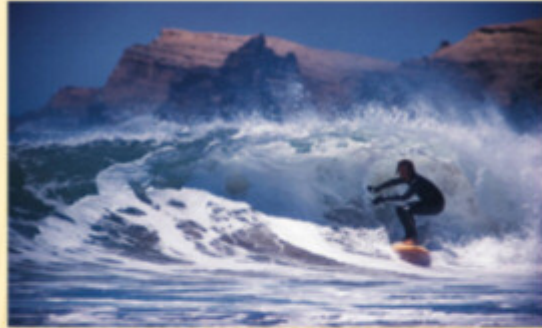
ride the storm baby!