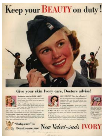
Keep your beauty on duty!

coming to Maebashi to participate in the marathon. They will arrive on the 22 th , me and my colleagues will guide them through Maebashi and Gunma's famous spots, plus a welcome reception will be held for them on the evening of the 25 th after the run. Birmingham is one of Maebashi's sister cities and has a famous track and field's club. Its runners often come visiting Maebashi on the occasion of the annual city marathon, to celebrate the friendly relationship that bounds the two cities. If you are interested in joining the party, please contact the Maebashi International